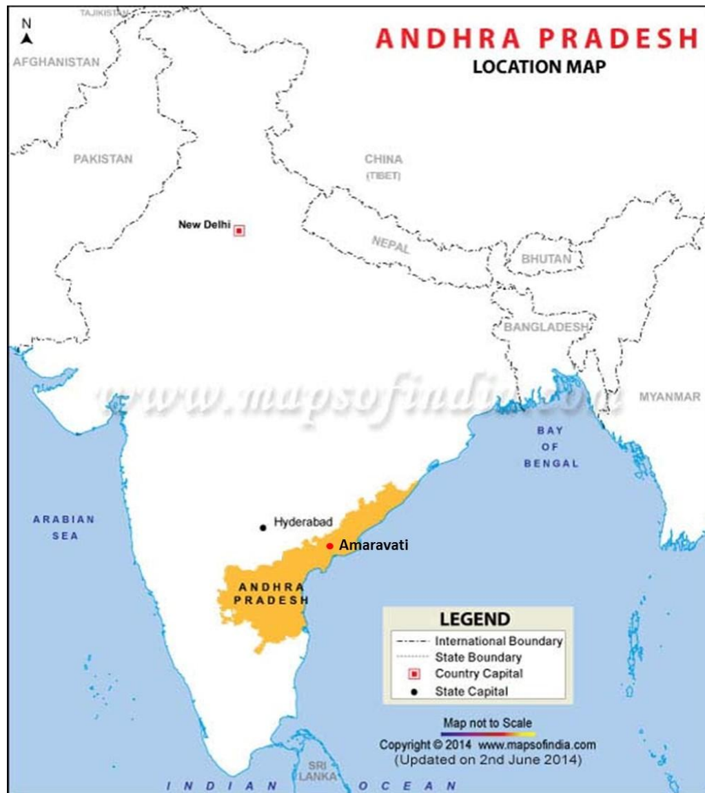
Andhra Pradesh State in India

Amaravati is the Capital City of Andhra Pradesh State in India. The planned city is located on the southern banks of the Krishna River in Guntur district, within the Andhra Pradesh Capital Region. The word "Amaravati" derives its name from the historical "Amaravathi" Temple Town, the ancient Capital of the Telugu Rulers of the Satavahana Dynasty.